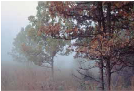
Flora Prairie Nature Preserve