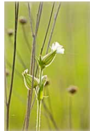
Distillery Conservation Area