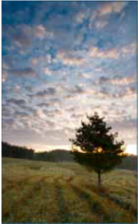
Kinnikinnick Creek Conservation Area