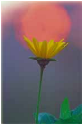
LIB Conservation Area