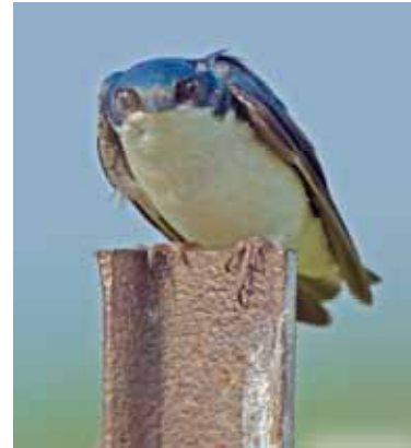
Distillery Conservation Area