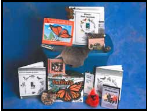
Illinois State Symbols

Illinois Department of Natural Resources