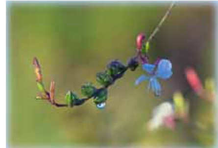
LIB Conservation Area